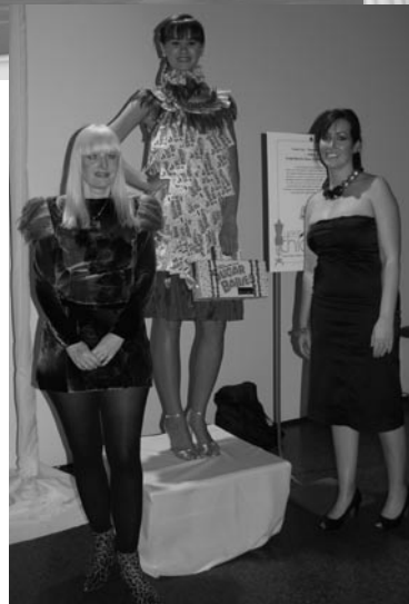
Tootsie Roll candies were well-represented in the fashions!