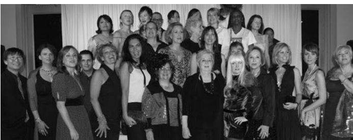
Chicago's leading apparel and accessory designers participated in the show.