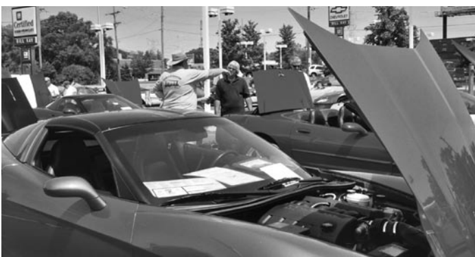
Windy City Corvettes members brought their pride-and-joy 'Vettes to display.