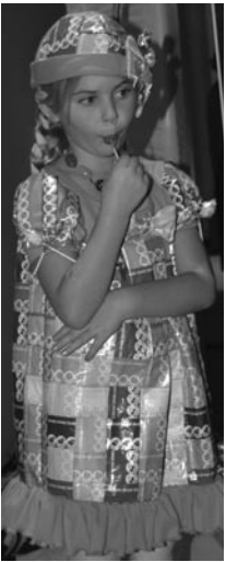
One of the junior models enjoys her "accessory."